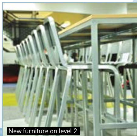
New furniture on level 2

These upgrades were made in response to client feedback, and it is anticipated they will improve the ambience of the Library and make it a more enjoyable place to study.