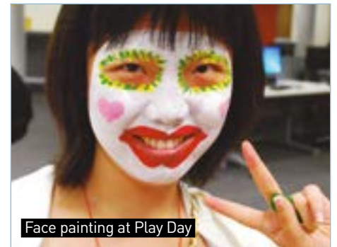
Face painting at Play Day

The activities include Giant Jenga, Zombie Scavenger Hunt, Xbox Kinect, Tarot Card Reading, and many more.