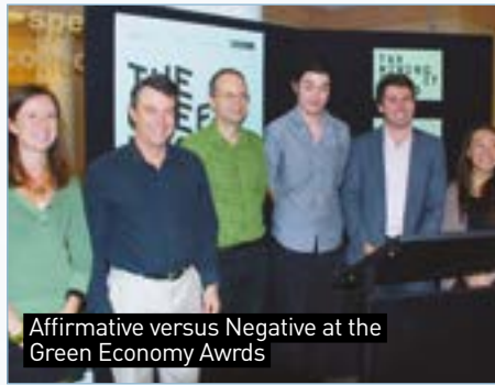
Affirmative versus Negative at the Green Economy Awards