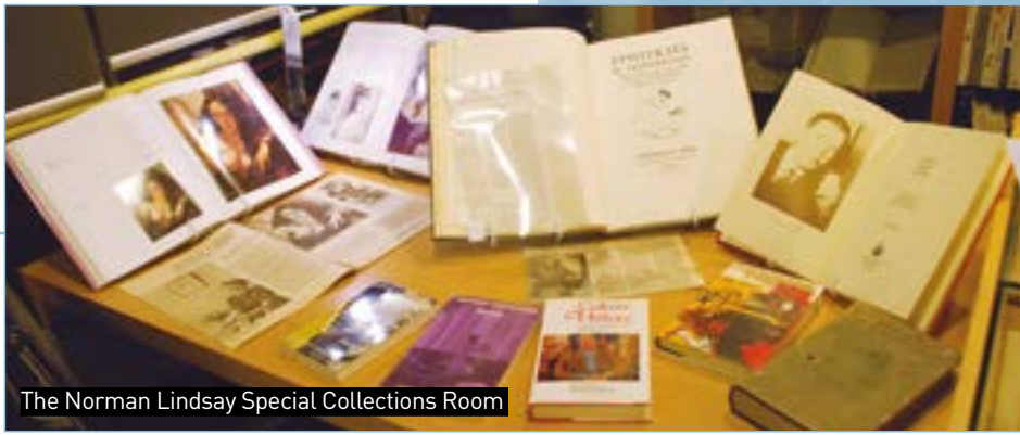
The Norman Lindsay Special Collections Room