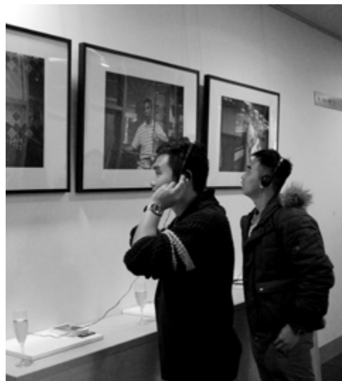
SUB / SYDNEY 2013 exhibition

The Library continues to be revitalised by a lively program of events and the promotion of cultural and creative works within the space. The Library's second